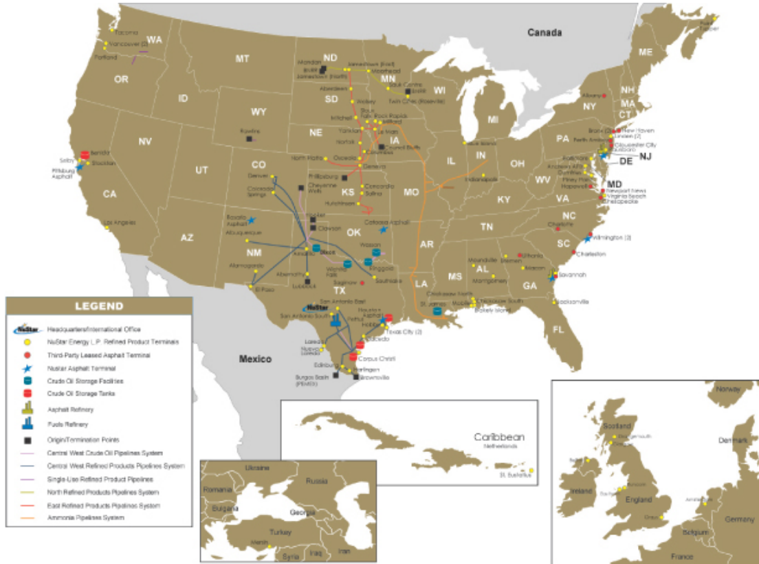
This map depicts our operations as of December 31, 2011.