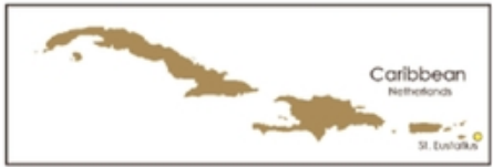
This map depicts our operations as of July 31, 2013.