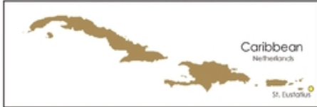
This map depicts our operations as of August 31, 2012.