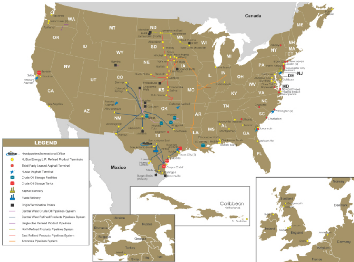
This map depicts our operations as of September 30, 2011.