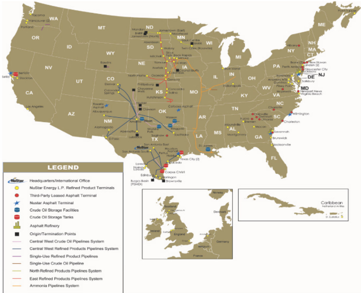
This map depicts our operations as of October 30, 2009