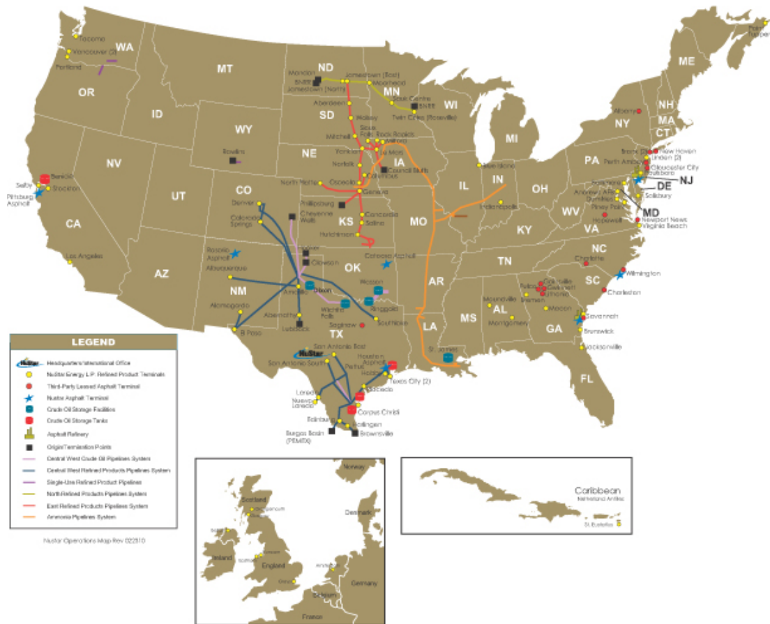
This map depicts our operations as of June 30, 2010.