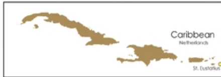
This map depicts our operations as of August 31, 2012.